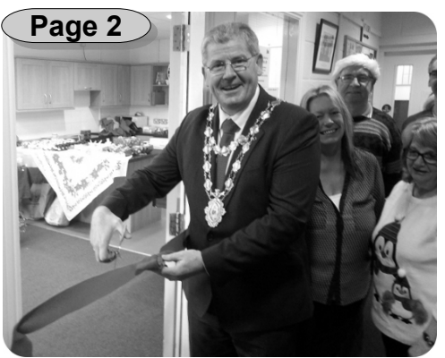
Mayor of the City of Galway, Cllr. Frank Fahy opening Westside Christmas Market on 10th December 2015.