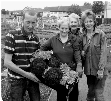
Garden volunteers bringing in the harvest.