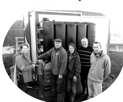
Westside Gardeners drawing the first water from the new water harvesting system.

Rain falling on the roof of the Community Garden's shed is collected and stored in a tank until needed. The tank is positioned on a raised plinth to ensure a good flow of water to all parts of the garden.